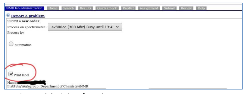
Figure 1: Submission of sample.

Login in our <u>LIMS System</u> on the spectrometer workstation. You will find a new checkbox on the submission page (Figure 1). Leave the box "Print label" activated and follow up the normal submission process.