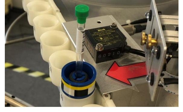
Figure 4: Marked position where to place a new sample. Barcodes adjusted to the barcode scanner.

Afterwards place your sample on the marked position (Figure 4). The barcode label needs to be adjusted when placing the tube on the changer so that the code bars are completely readable from the direction of the red arrow! If the marked position is occupied, please put your tube in the next free position.